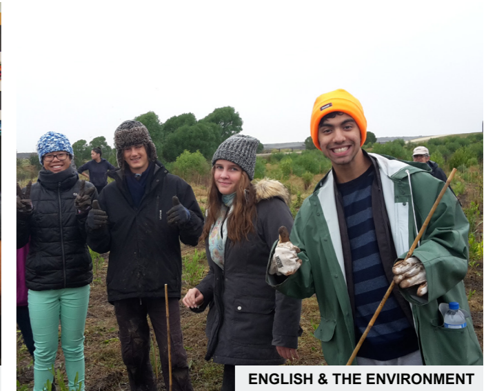
ENGLISH & THE ENVIRONMENT