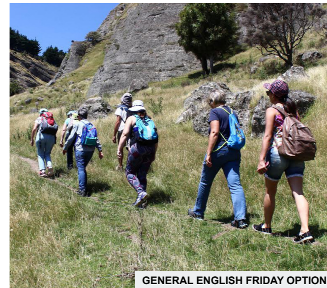
GENERAL ENGLISH FRIDAY OPTION