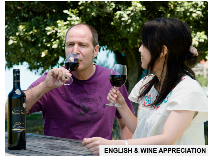
ENGLISH & WINE APPRECIATION