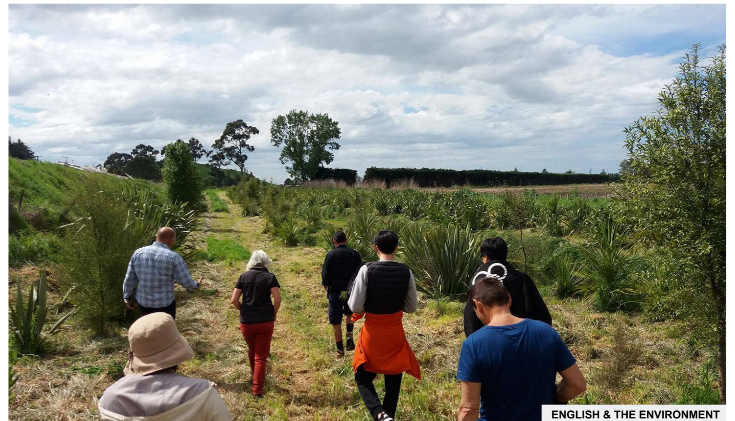
ENGLISH & THE ENVIRONMENT