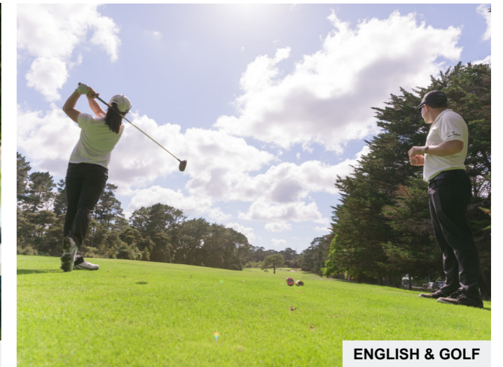
ENGLISH & GOLF