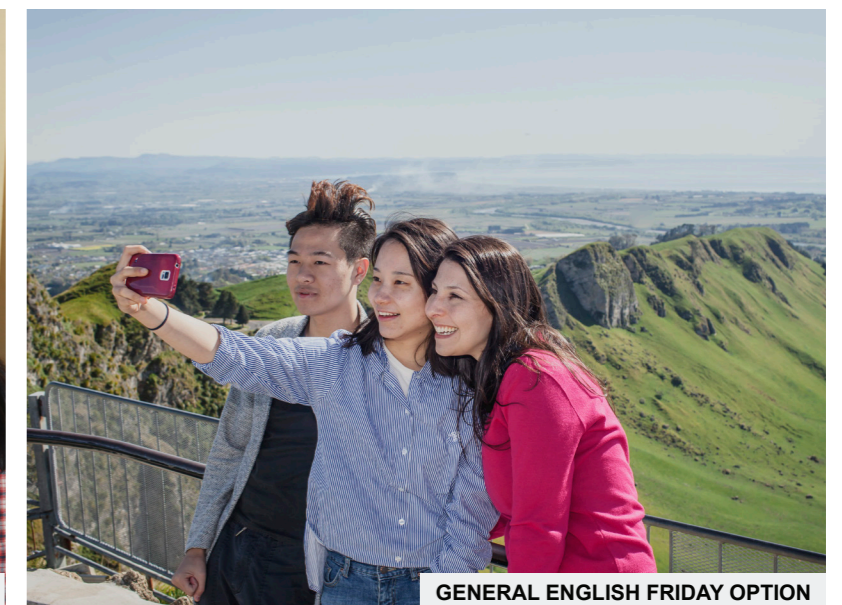
GENERAL ENGLISH FRIDAY OPTION