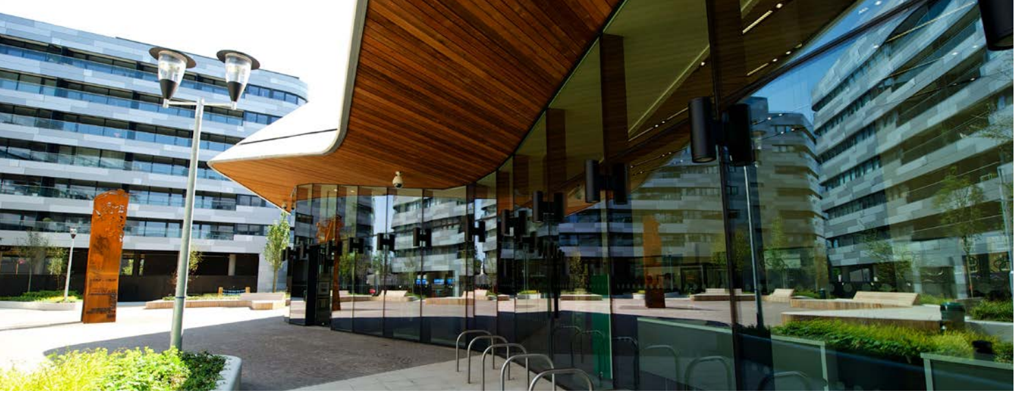
Twin Greenwich -- London