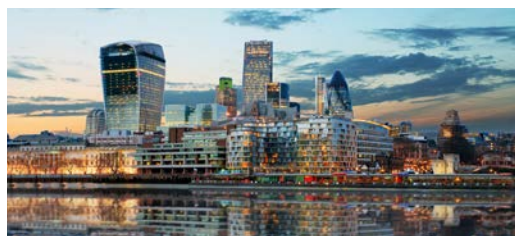
London city skyline