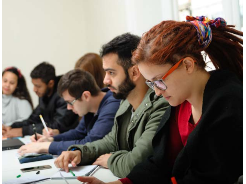
Intensive study at Twin Chapterhouse Dublin