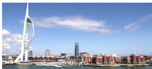
Spinnaker Tower, Portsmouth