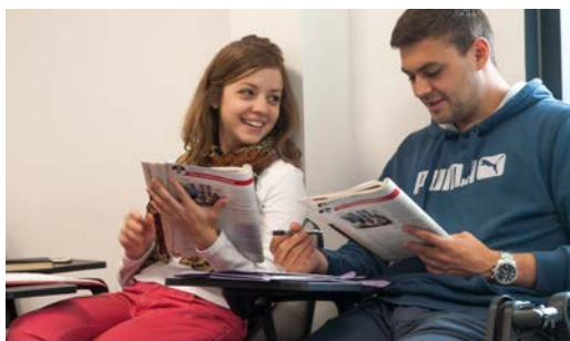
Personal development through learning

Our experience teaching English has shown us that there are three main reasons why students want to study English: for personal development, academic progression and for work and training. To help you find your way through our offers we have labelled our courses based on these categories.