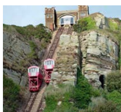
Funicular railway - Hastings