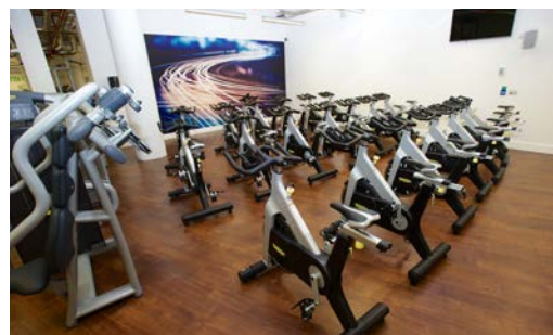
Greenwich Centre fitness suite*