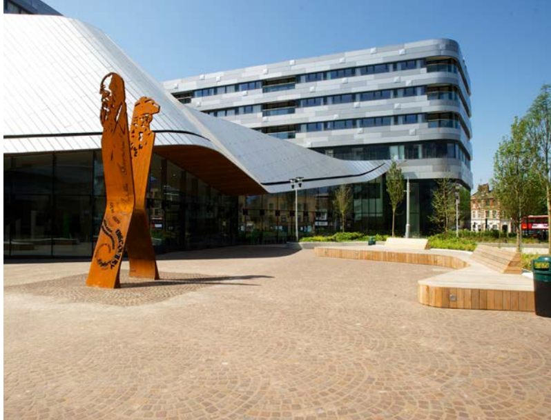
The Greenwich Centre, home of Twin London