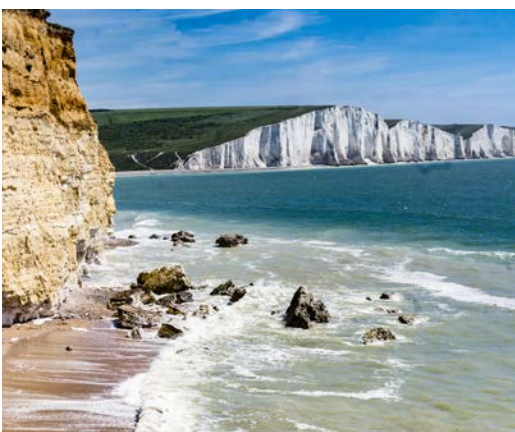
Beachy Head - Seven Sisters