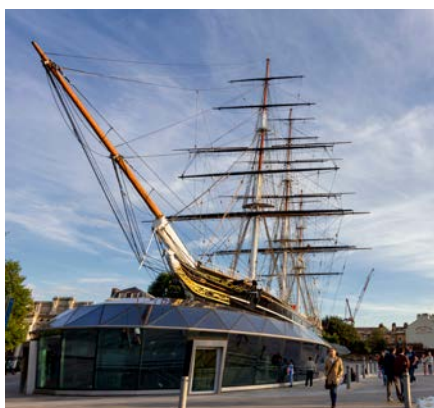
The Cutty Sark - Greenwich London