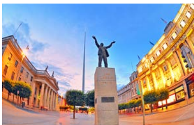
O'Connell street - Dublin

With the youngest population of any European capital, Dublin combines vibrant culture with traditional Irish heritage.