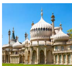
Royal Brighton Pavilion