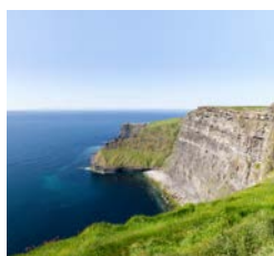
The Cliffs of Moher

Enhance your stay with optional excursions and attractions