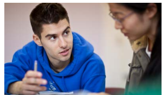
Collaborative learning at Twin Eastbourne

*Please note there may be a surcharge for outdoor activities and watersports.