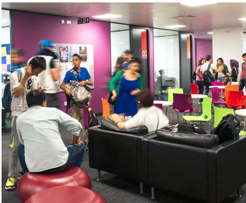
Twin London - Communal area

Ages: 10+ • Max class Size: 15 • Classrooms: 20 • Disabled access: Yes