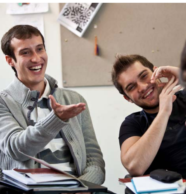
Students during a lesson at Twin London

Our wide range of courses cater to all needs, from improving core language skills with General English, to learning specific industry phrases and language with our bespoke professional courses. We like to think that our extensive choice gives an option for every learner.