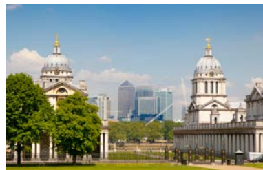
Old Royal Naval College

Greenwich is famous for its naval history, and only a short journey to the excitement of central London.