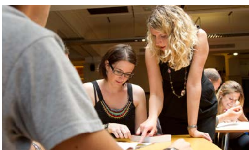
English for Engineers, a Twin professional course

Students often want to study English because they are on an academic path, with their objectives focused on academic success, whether at school or university. These courses help them reach their targets.