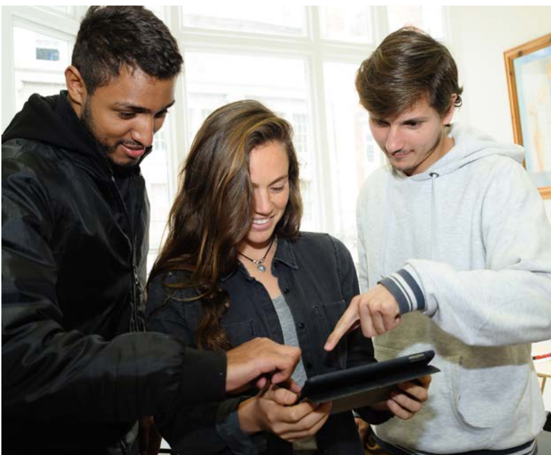
Students learning interactively

Ages: 16+ • Max class Size: 15 • Classrooms: 5 • Disabled access: No