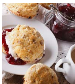
Tea with scones and jam