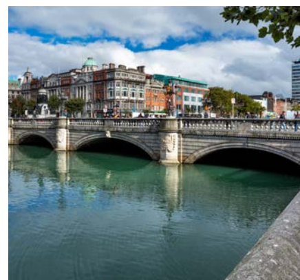
River Liffey - Dublin