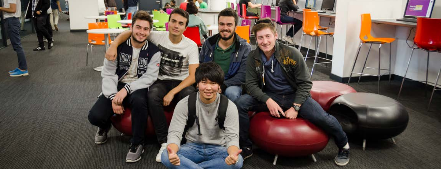
Students in Twin London