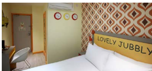
Hotel, Peckham - London