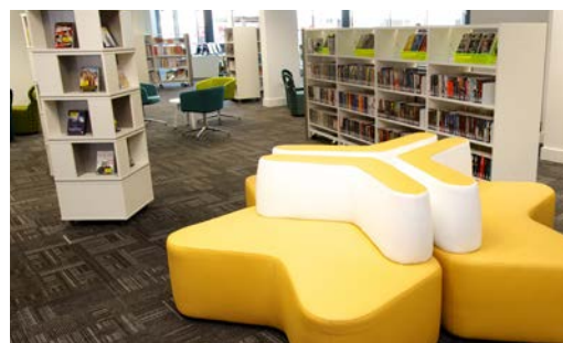
Greenwich Centre library

*Please note that a surcharge will be added for the use of these facilities