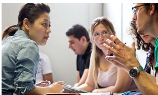
Preparing for academic challenges

These courses are for students who want to better their English skills because they see language learning as a challenge that can create opportunities and lead to new experiences.