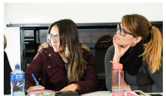
Students at Twin Chapterhouse Dublin