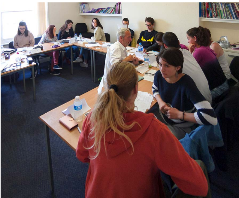
A classroom at Twin Eastbourne

Ages: 12+ • Max class Size: 15 • Classrooms: 6 • Disabled access: No