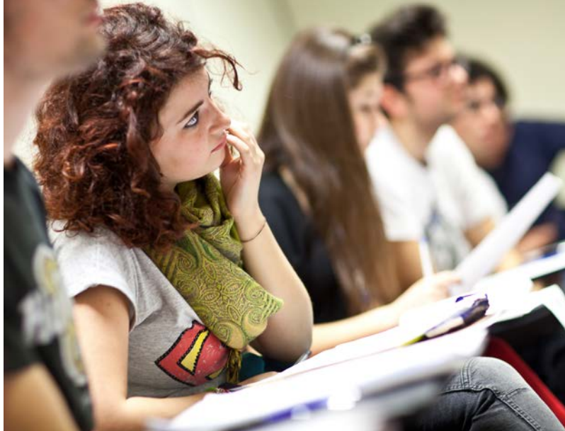
A student during a lesson at Twin London