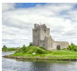
Dunguaire Castle - Galway