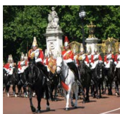
The Queen's Guard