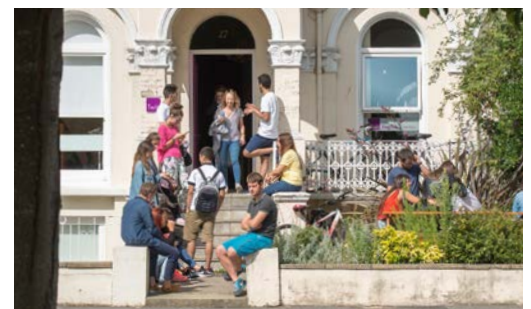
Outside Twin Eastbourne