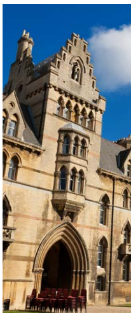
Christ Church - Oxford