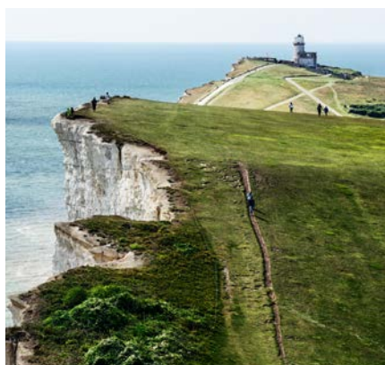
Seven Sisters cliffs - Eastbourne