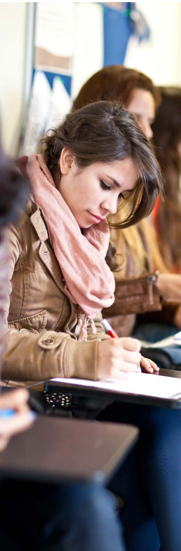
Students during a lesson at Twin London