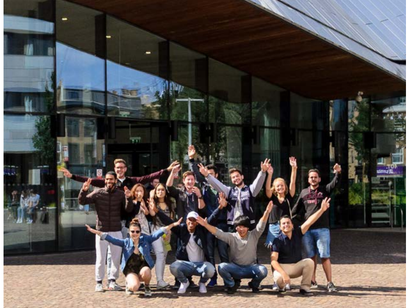
Students outside Twin London