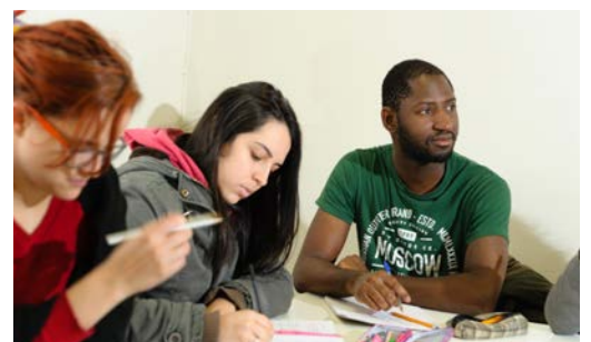
Students at Twin Chapterhouse Dublin