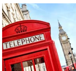
Big Ben - Westminster