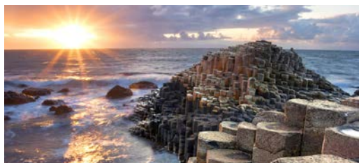
The Giant's Causeway - Northern Ireland