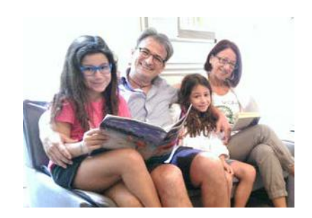
5-9yrs / YOUNG BLOOMERS