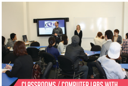
CLASSROOMS / COMPUTER LABS WITH INTERNET FACILITIES