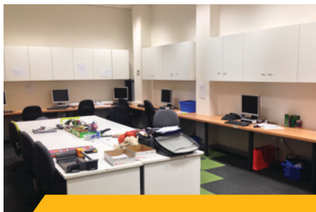
STUDENT PHOTOCOPYING / PRINT