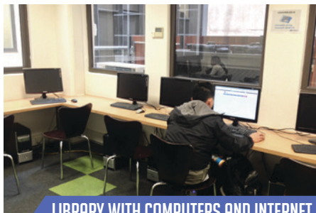
LIBRARY WITH COMPUTERS AND INTERNET FACILITIES