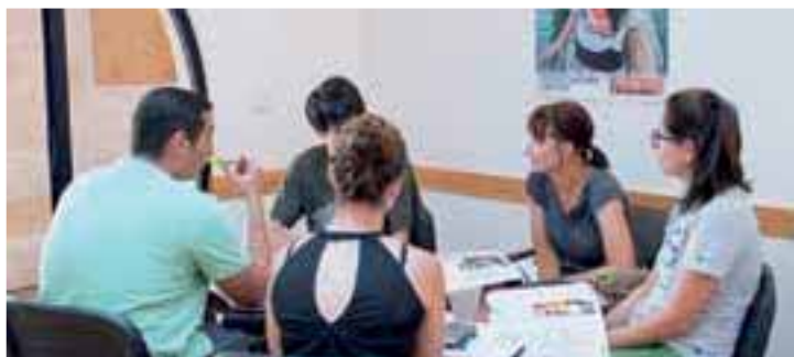
From our well-equipped classrooms and apartments to our peaceful gardens and world class swimming pool, we invite you to a truly inspiring environment.