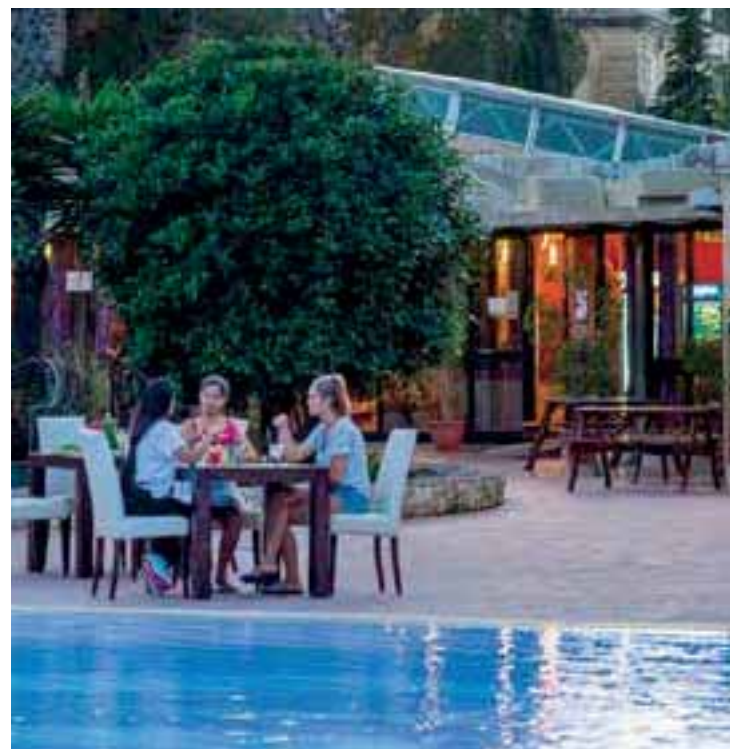
The picturesque town of St. Julian's, near which our English language school is located, is on the east coast of the island. Once a fishing village, today it is a bustling town full of restaurants, pubs and entertainment venues.

Western Europe 42% Americas 21% Eastern Europe 18% Asia 14% Others 5%