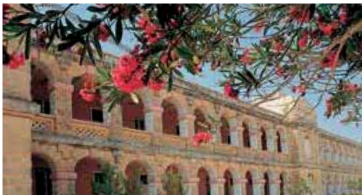
Our breathtaking campus consists of striking limestone buildings which truly captures the spirit of this Mediterranean paradise.

6 weeks starting from 1.615,- EUR Incl. course & accommodation