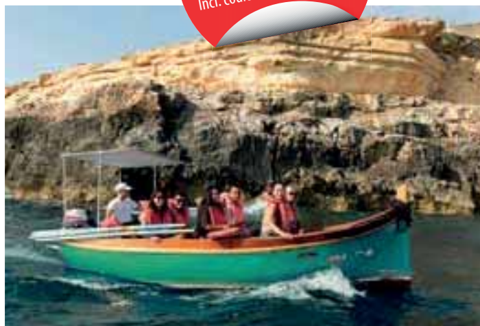
With year round sunshine and countless leisure activities, Sprachcaffe Malta guarantees learning success and unlimited memories.