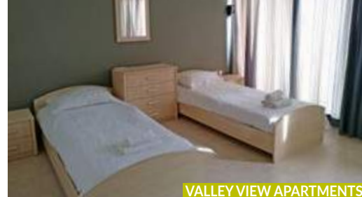
VALLEY VIEW APARTMENTS