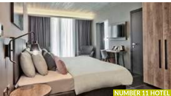
NUMBER 11 HOTEL