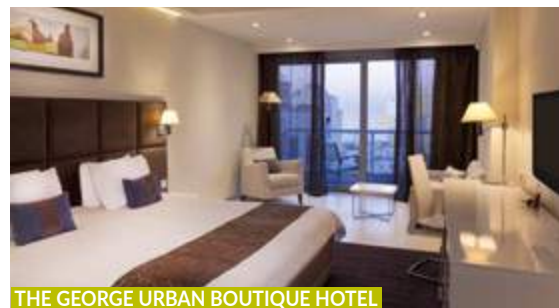
THE GEORGE URBAN BOUTIQUE HOTEL