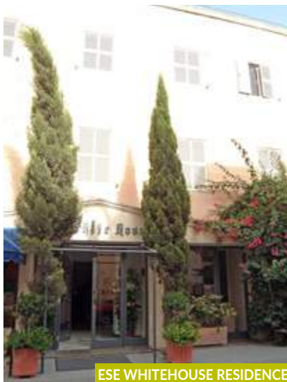
ESE WHITEHOUSE RESIDENCE

Located in-house, ESE Residence combines convenience with the luxury of a hotel style stay. Facilities include 19 modern rooms with twin or double beds and ensuite bathrooms, TV, phone, free wi-fi and air conditioning. One room also offers wheelchair friendly/disabled access. Breakfast is included and is served at the ESE in-house cafeteria on the ground floor of the school. This accommodation is popular with more mature students staying for 1-3 weeks.