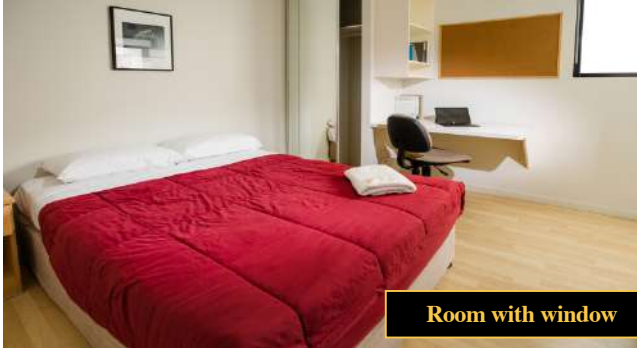
Room with window