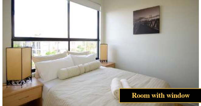
Room with window