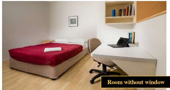
Room without window