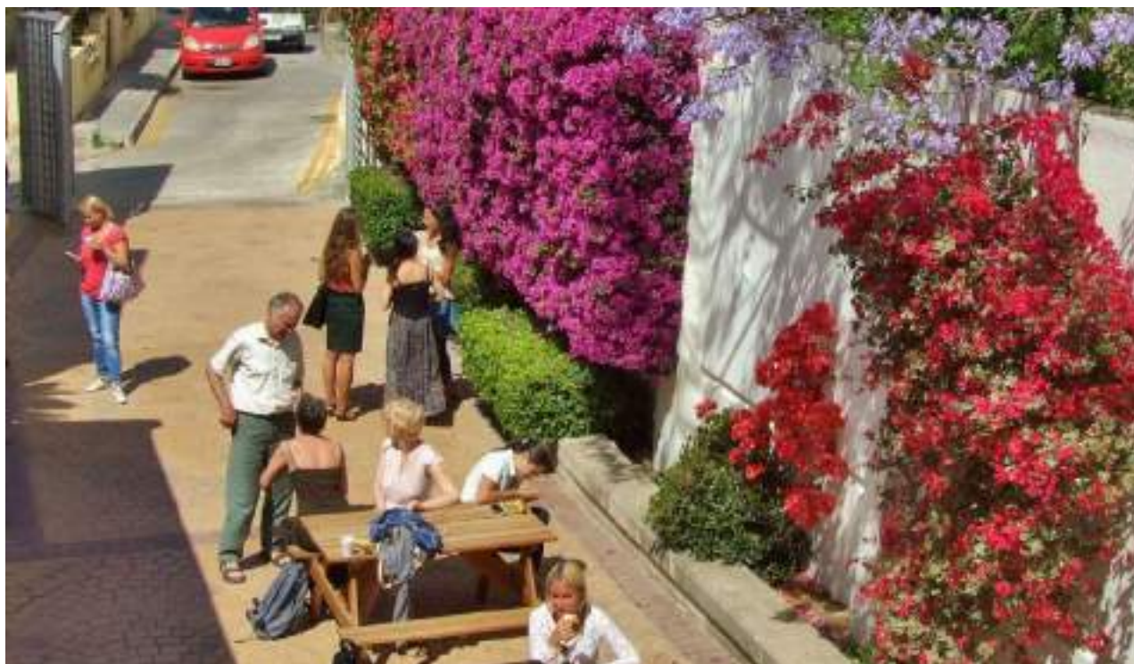
The school entrance and its front yard

Intercultural learning is a core concern of NSTS Malta because we know that intercultural competence is the key to being successful in an increasingly diverse world and is also highly relevant to your employability.