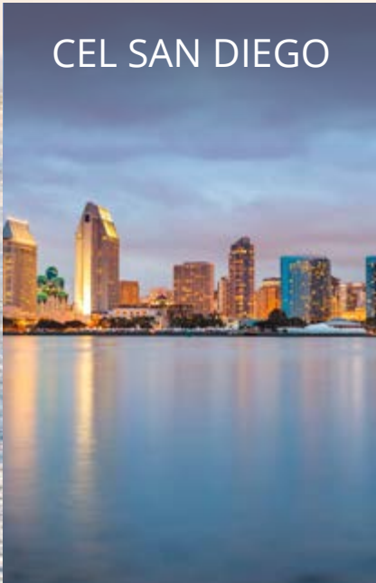
CEL SAN DIEGO