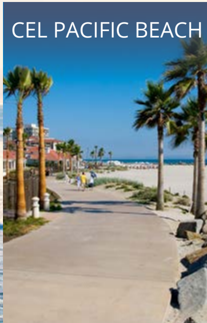
CEL PACIFIC BEACH